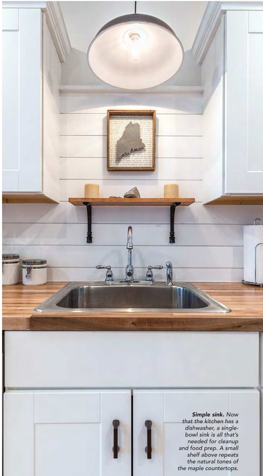
Simple sink. Now that the kitchen has a dishwasher, a single-bowl sink is all that's needed for cleanup and food prep. A small shelf above repeats the natural tones of the maple countertops.

Wayne Hymer is owner of Wayne Hymer Inc. in Portland, Maine.