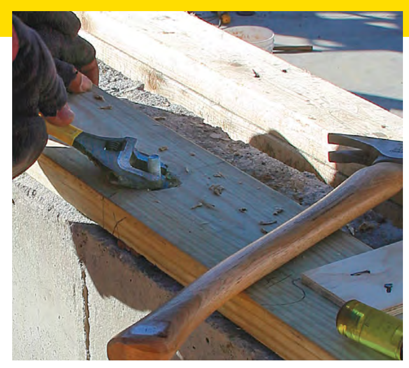
Make it flush. Once the countersink is complete, we add the nut and washer and tighten them down. Before installing the floor sheathing, we add an epoxy anchor on one side of the truss to compensate for the loss of holding strength caused by the countersinks.