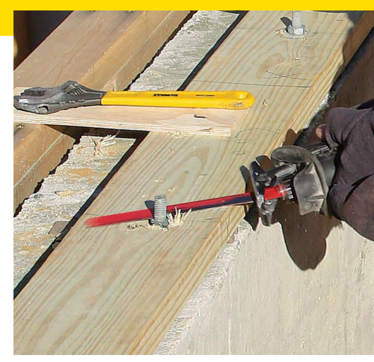
Shorten the bolt. Once the nut and washer are recessed and tight, we cut the bolt flush with the nut using a reciprocating saw equipped with a metal-cutting blade.