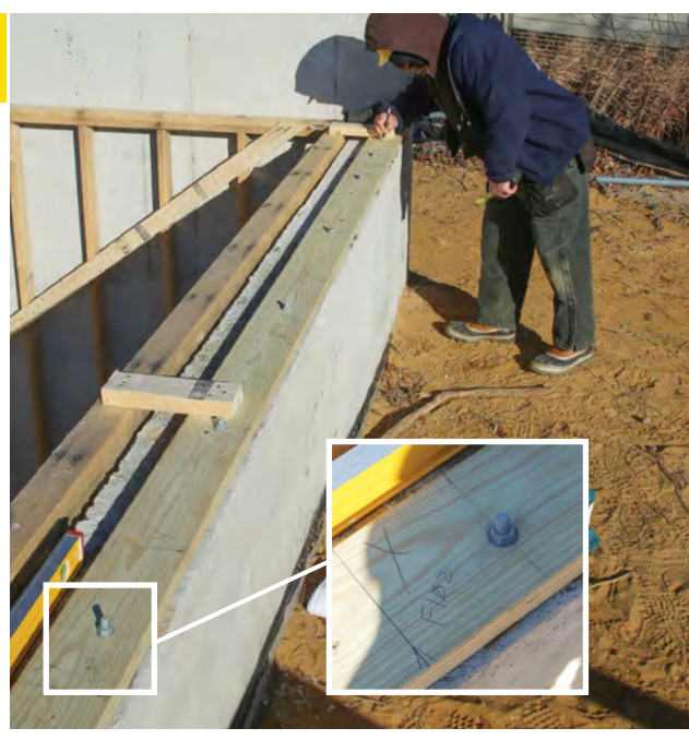
Lay out the rest. Next I mark the rest of the truss layout, which is often 16 in. on center for our builds, but wider (19.6 in. and 24 in.) spacings are also common.