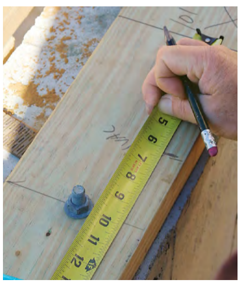
Transfer register locations. I use the center of the window opening, found on the floor plan, and transfer its location to the mudsill to mark the center of the register boot. Once the HVAC boots are marked, I lay out the trusses on both sides of the boot location.

You can't cut a truss to make room for an HVAC register or a closet flange, so the truss layout has to avoid pipes and mechanicals. To prevent problems, plan the exact locations of pipes and ducts before setting trusses and adjust the truss layout to avoid them. In this house, the floor registers are centered on the windows, and the trusses can't be in the way of register boots, so marking the layout starts with identifying register locations.