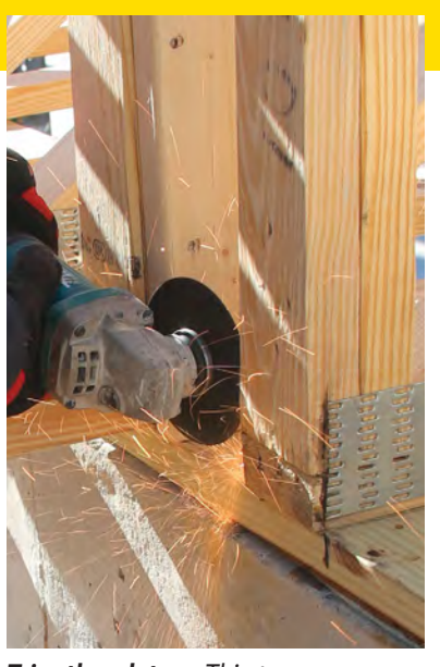
Trim the plate... This truss was a bit too long, and it was determined that shaving the end wouldn't be a problem. We start by trimming back the truss plate to the mudsill, which is where the truss should plane out.