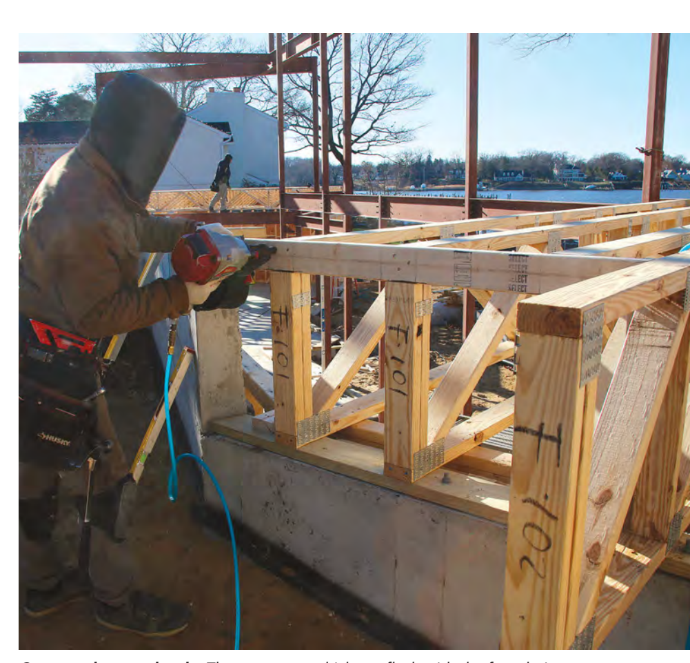
Connect the top chords. These trusses, which are flush with the foundation wall, have a 2x4 band to help plumb the trusses and strengthen the assembly. We transfer the truss layout to the band before installing it, and follow the component manufacturer's instructions for fastening.